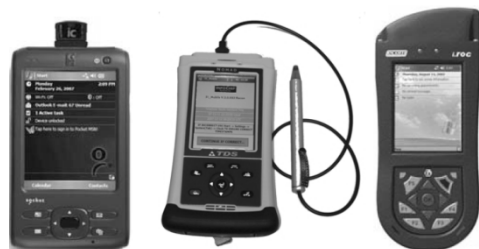
Built in camera, bar code, GPS and Intrinsically Safe models

The InfoChip Handheld is a Pocket PC device (tablet compatible) with a built-in chip reader/writer which is capable of scanning High Frequency 13.56 MHz RFID chips (ISO15693). The handheld hosts the IC Mobile application and a resident asset database is referenced when scanning an RFID chip or keying in the asset serial number as a backup. It features an easy-to-use visual interface for reading information and for uploading inspection and inventory updates to IC Online . Various units are available including wireless, basic, bar code, camera, rugged and intrinsically safe. The readers are InfoChip tuned to read high-frequency chips embedded in metal environments. We are the only vendor to prove/guarantee the read/write of InfoChip authorized chips in all metal environments.