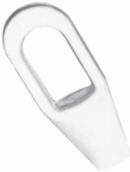
LB - 305